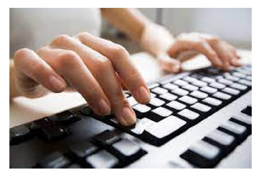
A BIG THANK YOU to all who responded to our first request!!!

This project's purpose is to make it easier for your fellow Rotarians to find you, by updating and correcting some information on our Rotary platform, specifically in the Professional Classification and Sub-Classification fields.