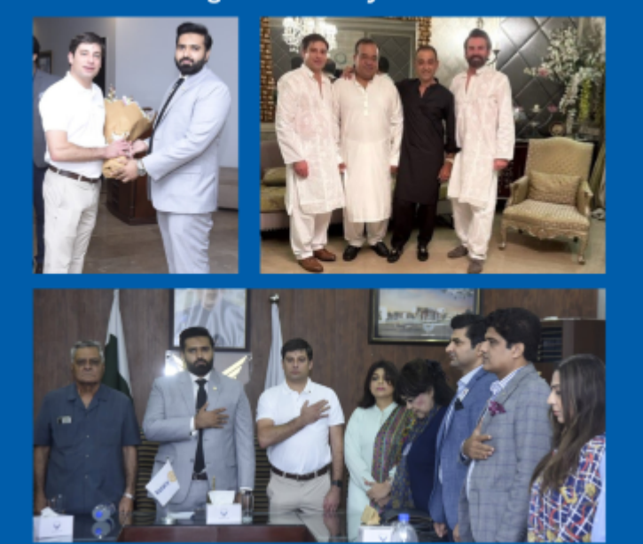
Greetings from Rotary Club Pakistan